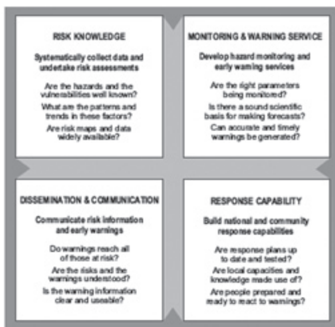
Figure 2.2. The Four Elements of People-Centred Early Warning