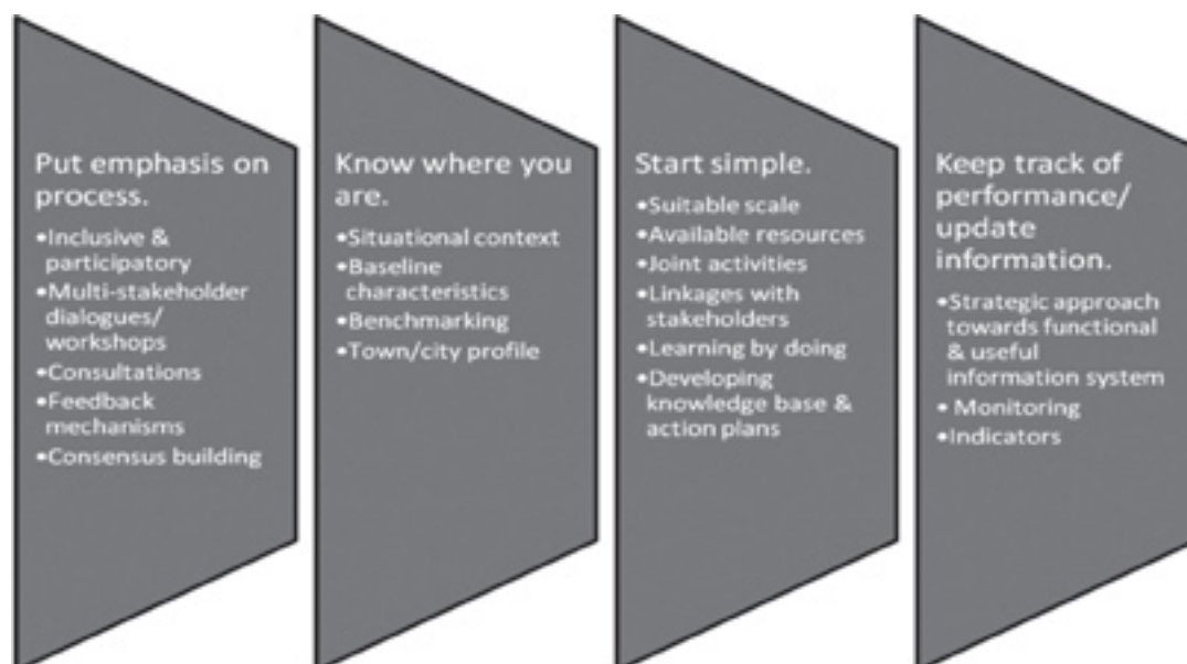
Figure 0.1. Pointers on undertaking the local/city disaster risk reduction tasks

regulations, as well as economic and social pressures, and a common appreciation of relative risk. Each locality may have context-specific issues related to various aspects that include gender, culture, indigenous practices, and local knowledge, among other things. The profile serves as documentation of the situation and context of the city/town; subsequently, it needs to be updated regularly to provide a comprehensive overview or state of disaster risk reduction in the city/town. The profile shall help provide a common understanding of risk-related problems to the population.