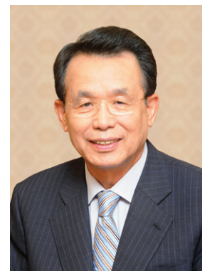
H.E. Mr. Han Seung-soo

Now is indeed the time for action. I invite you to partake in this noble enterprise of saving our planet, our home, by taking real, tangible steps as set out in the Action Plan. As inhabitants of this planet we share a common destiny in finding solutions to this difficult problem for the benefit of mankind.