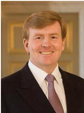
H.R.H the Prince of Orange Chairperson

United Nations Secretary- General's Advisory Board on Water and Sanitation