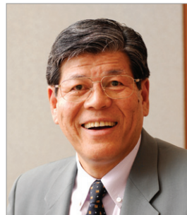
Hiroaki Taniguchi Vice-Minister for Engineering Affairs, Ministry of Land, Infrastructure, Transport and Tourism, Japan