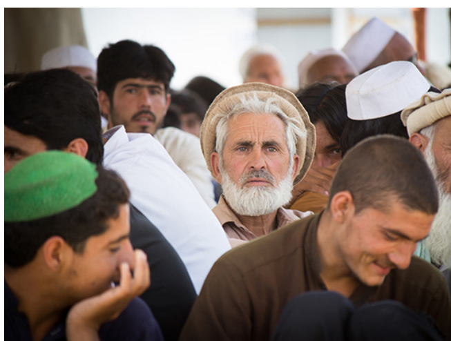
A displaced elder for Tirah valley is waiting in queue for the registration in Jirna, District Kohat, Pakistan.

Counter-terrorism and counter-insurgency operations and violent clashes between non-state armed groups continue to lead to major, rapid movements of internally displaced people (IDPs) in Pakistan's volatile north-west. Within the Federally Administered Tribal Areas (FATA), Khyber and Kurram agencies are currently the worst-affected areas. More than 415,000 people were newly displaced in 2012, and at least 131,000 more have fled their homes since mid-March this year ( OCHA , March 2013, p.2; OCHA , 6 June 2013). There are now 1.1 million IDPs registered as displaced by conflict in the north-west, and many more are unregistered in the region and elsewhere ( IDMC , 31 May 2011, p.1; UNHCR , 7 May 2013).