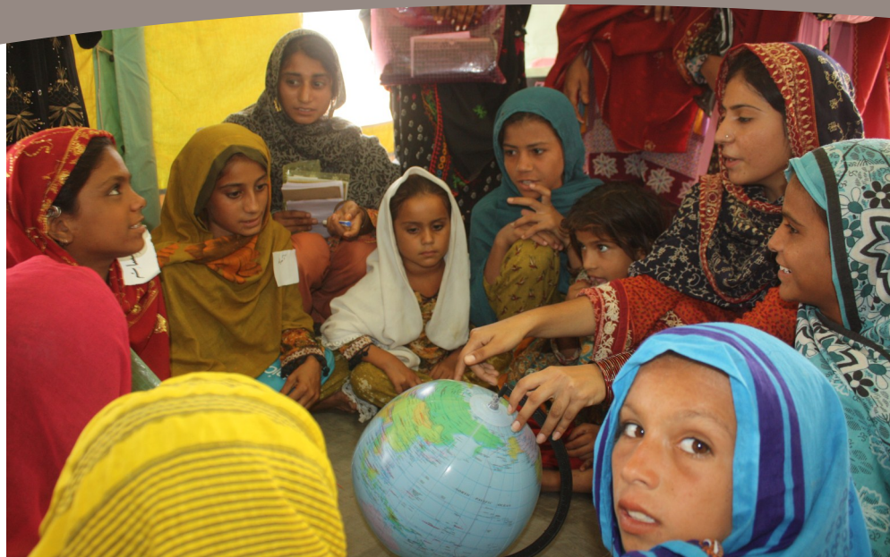
Orientation Session in TLC Supported by UNICEF in Jacobabad of Sindh

This edition covers the response between 06 October and 02 November 2012.