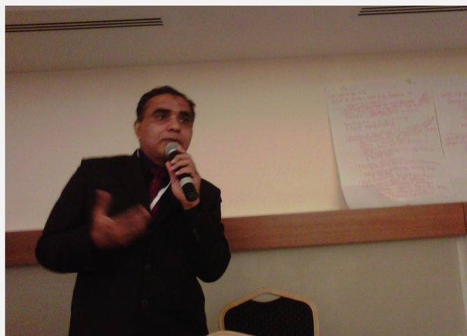
Sindh Education Cluster Chair Presenting in Global Education Cluster Meeting on 24 October 2012 in Istanbul