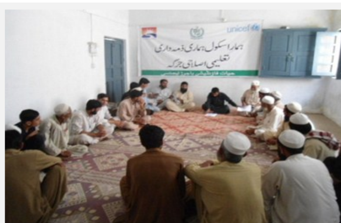
Meeting of Taleemi Islahi Jirga (TIJ)