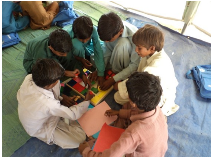
Children are playing in TLC, in U.C Bhugra Memon Taluka Badin

These supplies have helped in providing to access to education for these children, especially the first timers. During the reporting period, more supplies including recreation kits were sent to Badin for 250 TLCs.