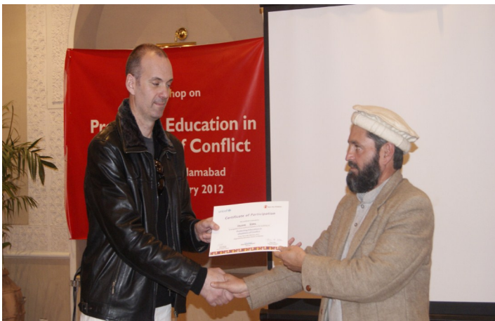
Save the Children Country Director, presenting certified to Deputy Director Education FATA

Workshop on Protecting Education in Conflict affected countries was held by Education Cluster in Islamabad, with collaboration of Global Education Cluster from 7 th to 9 February 2012. Workshop was attended by over 30 participants from UN agencies, INGOs, NGOs and government and local organization working in field at KPK and FATA.