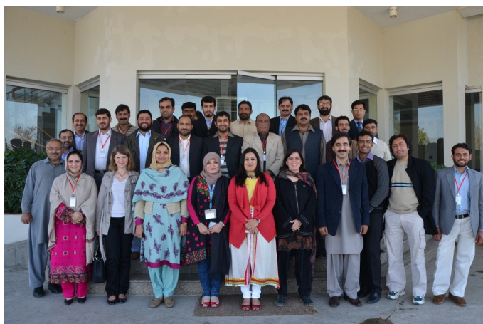
Group photo of two training on DRR, Islamabad

Save the Children conducted two days training on Disaster Risk Reduction from 28 th to 29 th 2012 in Islamabad. The training was attended by over 30