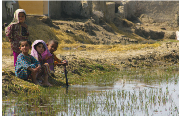
Sindh was devastated by repeated monsoon flooding

Medicines for malaria, diarrhea, fever and other