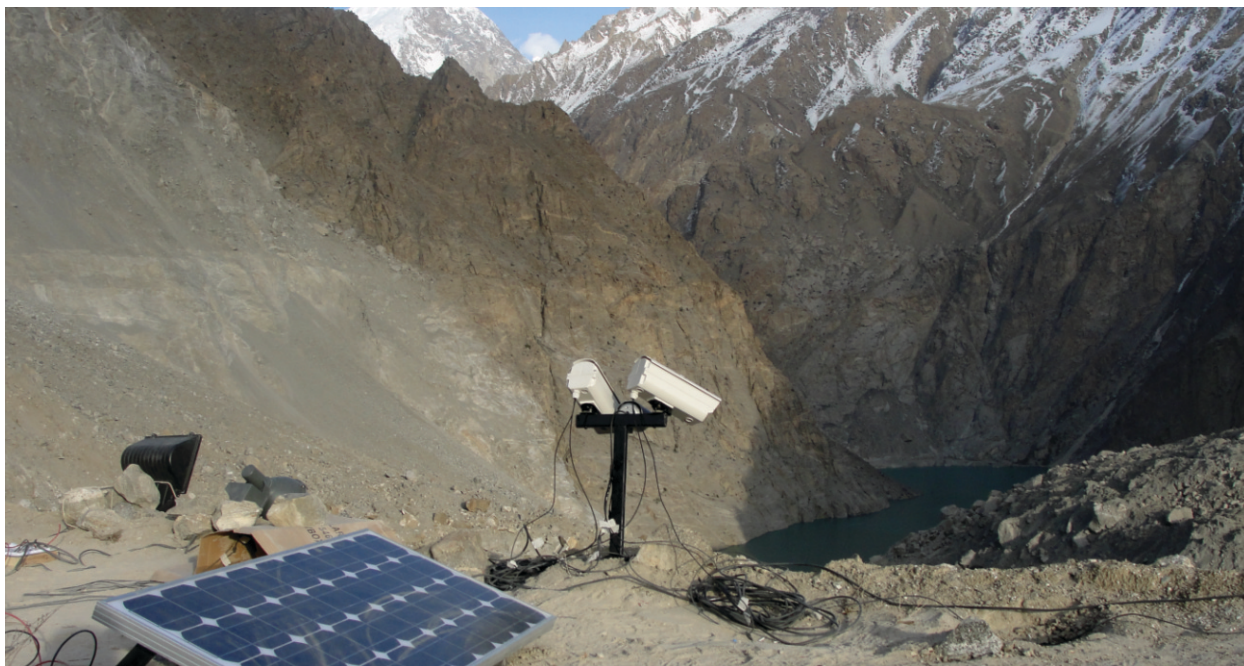
The monitoring station, high above the lake at Attaabad, keeping a watchful eye on the water level