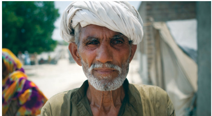
It is estimated more than two million people work directly in the brick kiln sector

Bonded labour is widespread in the brick kiln sector because of the informal economic market. Many brick kiln owners prefer to keep their brick kilns unregistered to avoid implementation of labour laws and to evade taxes. Brick kilns are mostly located in the rural areas or on the outskirts of cities, due to the ready availability of cheap land and labour. Therefore, the issue bonded labour often remains invisible and unnoticed. According to ActionAid Pakistan and their partners there are more than 10,000 brick kilns operating in Punjab. It is estimated that about 2.1 million people work directly in the brick kiln sector. Over 50 per cent of workers are women and children.