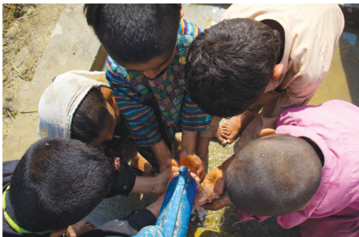
Clean water is now available to displaced families in Nowshera

Two-way communication is extremely important