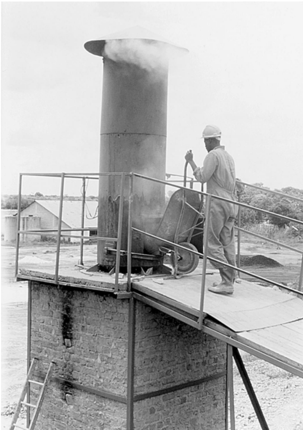
Figure 1: Loading stone/fuel through the hopper at the chimney level, lime kiln, Chegutu, Zimbabwe

If simple, field methods are to be used, it is easier to test the quality of 'lime' when it is in the form of quicklime, i.e. calcium oxide \text{CaO} . This would be the case if the lime were being bought direct from a kiln before the kiln operator had started to hydrate it. Usually, though, as quicklime will deteriorate if left exposed to the air and because it can be a hazardous material to handle, lime is more usually available and purchased as hydrated or 'slaked' lime, i.e. calcium hydroxide \text{Ca(OH)}_2 .