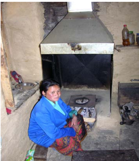
Figure 3: Woman sitting beside smoke hood, Nepal.

In Kenya, a well-known low-cost upes stove is built under the hood in place of the open fire, as in Figure 2. The upes is a well accepted ceramic stove which can be built into a base, with the hood set over the top to provide a neat safe environment – reducing the risk of burns and reducing the fuel costs. Currently, another type of stove, built on a principle called a ‘rocket’ stove, is being researched. If this research proves successful, the stove will reduce emissions and fuel costs, and the smoke hood can still be used for venting any residual smoke up the smoke hood. The smoke hood is sufficiently versatile to allow these changes to happen.