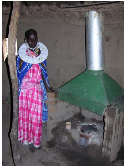
Figure 4: Maasai woman standing beside her smoke hood, Tanzania.

In Nepal, the traditional stove is a three-legged tripod with a circular metal ring on the top where the pots can sit. By building around the back of the stove, more heat is directed at the pot, increasing efficiency, whilst those sitting around the stove can still see the flames (Figure 3). The dry-stone walls of the houses have been insulated as part of the project, as shown around the smoke hood in Figure 3. This means that less heat goes out through the walls, compensating for the heat lost through the chimney in the vented smoke.