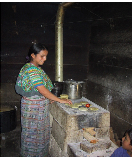
Figure 1: A well-designed chimney stove disseminated by HELPS International in Central America.

In theory, a chimney stove seems a perfect solution. With nowhere else to go, the smoke vents into the open air outside the house. A well-constructed and maintained chimney stove can get rid of most of the smoke.