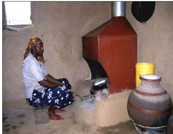
Figure 2: Woman sitting beside smoke hood, Kenya.

Technically, the most important factor is the ratio of the area of opening to the flue cross-sectional area – ideally a ratio between 1:10 and 1:7 – the larger the better within these ratios. The flue must be tall enough to prevent ‘blow back’ into the room, and to keep the hot gases away from any inflammable roofing materials.