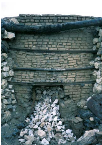
Figure 1: A traditional lime kiln in Sudan

Calcite is a limestone which contains only calcium carbonate, \text{CaCO}_3 . There are other types of limestone which are of interest. Dolomite has the chemical formula \text{CaCO}_3\text{MgCO}_3 , i.e. it is a 'mixture' of calcium and magnesium carbonates in the proportion 1:1 of their molecules. Dolomitic limestones are those which contain some proportion of dolomite. Similarly, quicklime and hydrated lime may contain oxides and hydroxides of magnesium as well as of calcium.