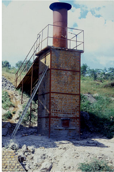
Figure 2: An improved vertical shaft kiln in Zimbabwe

Lime burners are generally seeking to produce the highest quality quicklime possible from their stone whilst keeping their production costs to a minimum. In the majority of cases, a very major production cost will be the fuel used. Thus, the efficiency of the burning process (as opposed to the whole process of production which will involve labour costs etc.) is judged by how much fuel it takes to produce a quantity of quicklime. For instance, a lime-burner may say "I produced X tonnes of quicklime using Y tonnes of coal which cost me Z dollars". However, in order to compare different types of kilns using various fuels and producing quicklime of variable quality, it is necessary to develop a more universal measure of efficiency.