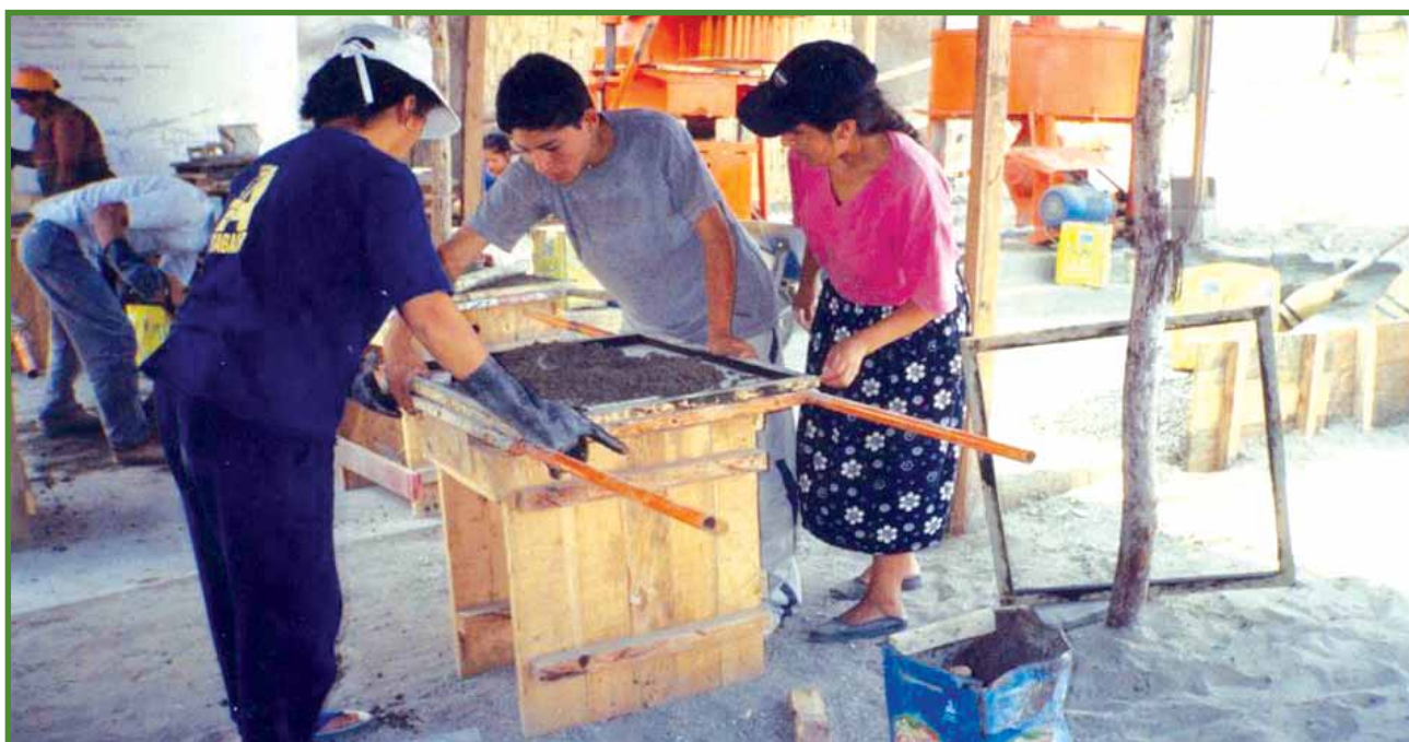
Production of construction materials for disaster resistant housing in Lima, Peru

GROOTS International's Thematic Programme on Community Resilience seeks to empower grassroots women to build resilient communities. This programme emerged from member organizations' work in disaster-hit communities in India, Turkey, Honduras and Jamaica. Member groups found that disaster response programmes were opportunities for women to become active participants in shaping the futures of their communities. Through their participation, grassroots women have developed innovative solutions that address practical problems of shelter, credit, livelihoods and basic services – all of which lie at the intersection of resilience and development. What is unique about these grassroots solutions is that they also re-position women in the eyes of their families and communities. This publication highlights roles that grassroots women are playing in building resilient communities and insights emerging from resilience building efforts led by grassroots women in Peru, Jamaica, Honduras, Turkey, Indonesia, Sri Lanka and India.