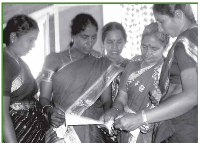
Community leaders look at emergency task force manual

Groots International has a strong commitment to promoting peer learning processes as a means of transferring knowledge and skills across grassroots groups. Over the last year, as part of our efforts to prepare a network of community trainers on resilience building GROOTS International in partnership with AJWS have been supporting grassroots leaders from nine different organizations to identify their skills and knowledge, prepare curriculum, tools and materials to train other disaster-prone communities.