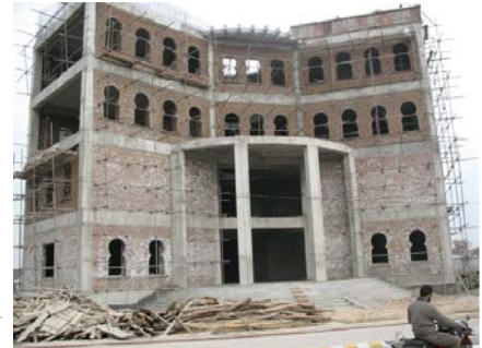
Figure 3: Construction of building in progress.