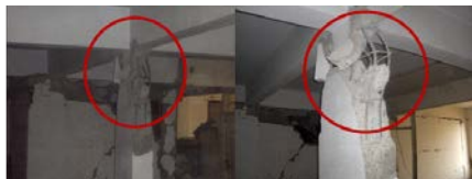
Figure 4: Typical damage pattern of strong beam-weak column in 2005 Kashmir earthquake.

A low to moderate seismic activity has been active in many parts of Pakistan, especially in the Northwestern province, though the other parts of Pakistan had also experienced mild to severe intensity earthquakes in the past. In 1936, the earthquake with a magnitude of 8.1 on the Richter scale, that hit the capital of the Balochistan province, Quetta, resulted in a very high death toll (around 30,000 killed). But the usual seismic activity occurs in the northwestern part of Pakistan with the epicenter in range of 250 kilometers from the provincial metropolis, Peshawar. According to MSK, Peshawar may be placed in intensity zone VI or at most in VII, Islamabad in VI, and Lahore in V. In October 2005, a strong earthquake hit the upper northern parts of the NWFP province causing severe damage to buildings and resulted in loss of lives in the tune of 70,000.