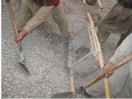
Figure 7: Manual batching of concrete may result in mix proportions different than the specified proportions.

Unit construction cost of reinforced concrete buildings in Pakistan is highly variable. The cost varies according to the location of the building to the amount of facilities provided in the building. 10-15 persons working 8 hours a day can complete an approximately 280 square meter building in four months.