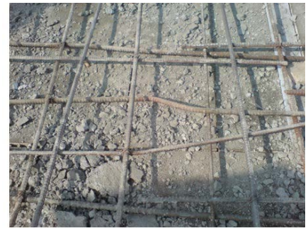
Figure 9: Stomping of laborers over the reinforcement change its configuration thus hampering its intended function.