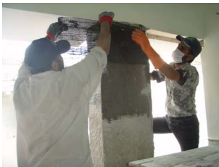
Figure 11: CFRP jacketing is used in some buildings to strengthen the existing columns.

There has been no earthquake of appreciable damage potential since this work was carried out to assess the performance of the strengthened building.