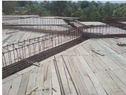
Figure 8: Use of sub-standard formworks result in concrete dimensions different than the designed dimensions.