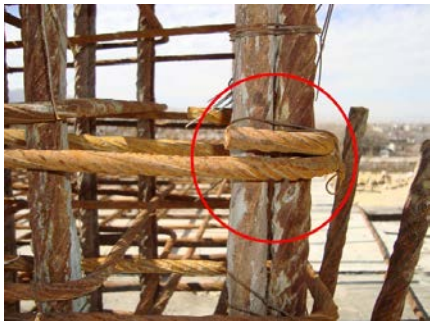
Figure 10: Lack of provision of seismic hooks despite following the SMRF configuration may result in performance much lower than designed one.