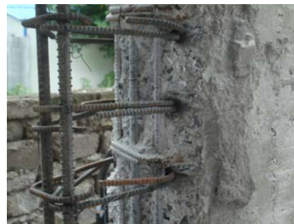
Figure 12: Resizing (widening) of the columns are carried out to increase the potential of the structural system.