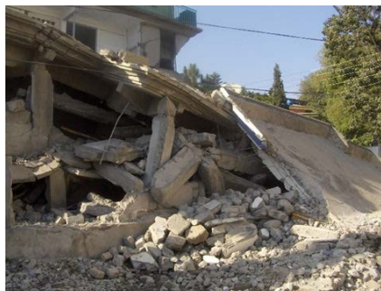
Figure 5: Total structural collapse of reinforced-concrete building in 2005 Kashmir earthquake.