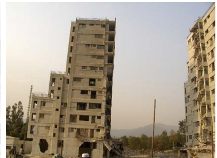
Figure 6: Global instability of a reinforced-concrete building during Kashmir 2005 earthquake.